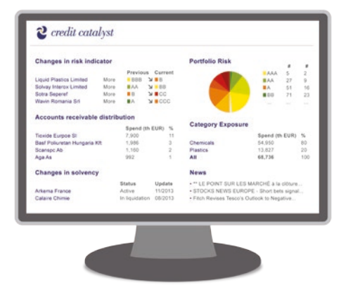
Create your own dashboard for a customised view of your portfolio and priorities